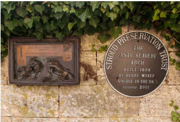
Plaques by the Anti-Slavery Arch, Pagan Hill, Stroud

The Medieval Hall , 32-34 High Street, Stroud, and SPT's first project, was part of a discussion about open spaces in the town, partly prompted by the emerging NDP but also by a proposal to fence in the garden area. SPT as the freeholder stays neutral in this matter. It is our preference that the garden remains open, but it is the leaseholder's responsibility to make such decisions about their own land. The garden belongs to the Medieval Hall and with the current owner it will remain open. However a future owner may not hold to this position.