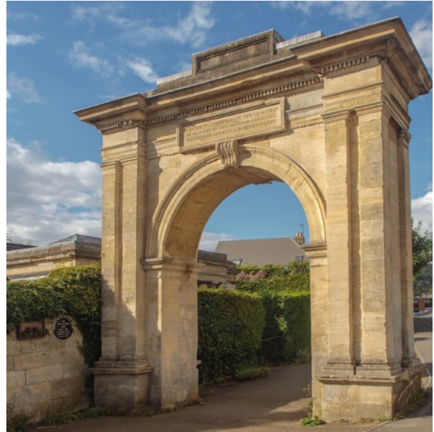
The Anti-Slavery Arch, Pagan Hill, Stroud

General work has included liaising with Stroud District Council planning and conservation staff, seeking information on Conservation Areas and action on various buildings at risk. SPT increasingly acts as a pressure group including: meeting with