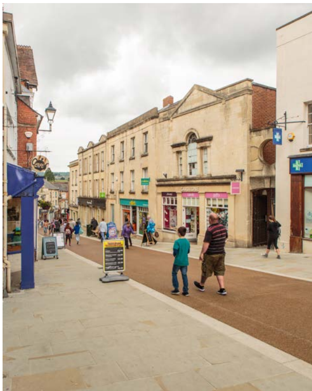
High Street, Stroud